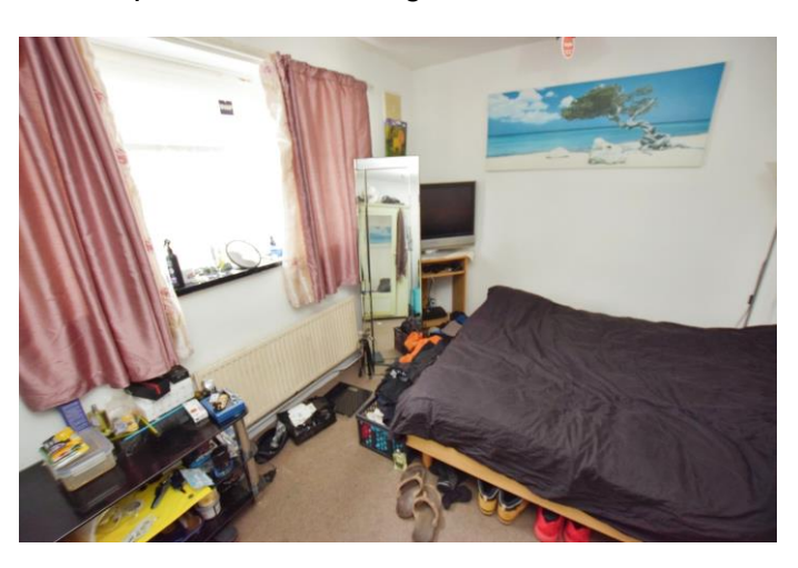
Bedroom Four 11' 11" x 7' 7" (3.625m x 2.303m) Front aspect uPVC double glazed window. Radiator.

Bedroom Three 8' 7" x 10' 8" (2.626m x 3.258m) Rear aspect uPVC double glazed window. Radiator.