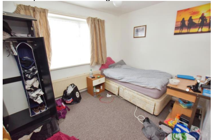
Bedroom Five 10' 7" x 6' 3" (3.224m x 1.896m) Front aspect uPVC double glazed window. Storage cupboard. Radiator.