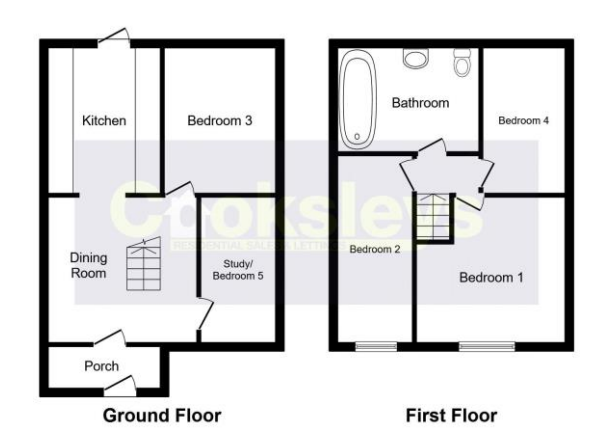
Total floor area 80.7 m² (869 sq.ft.) approx This plan is for illustration purposes only and may not be representative of the property. Plan not to squite. Powered by PropertyBox

Whilst we endeavour to ensure the accuracy of property details produced and displayed, we have not tested any apparatus, equipment, fixture and fittings or services and so cannot verify that they are connected, in working order or fit for the purpose.